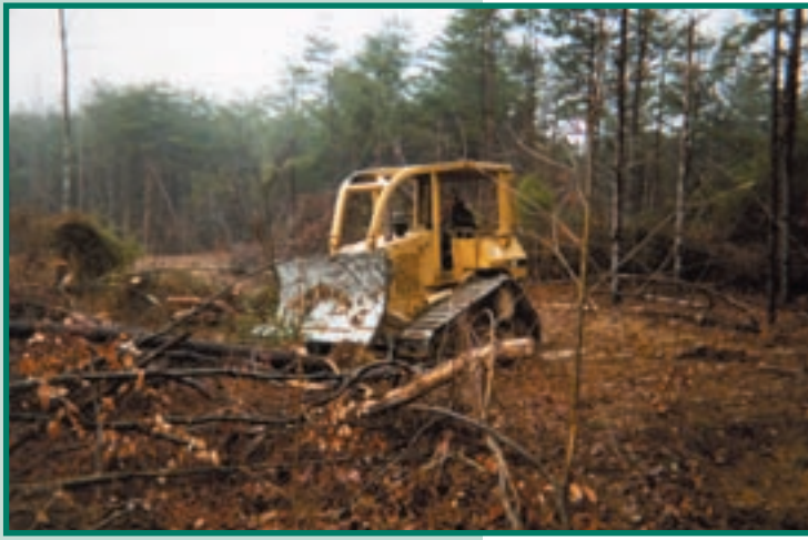
Figure 2. A forest opening being created in an ice and snow damaged pine stand with a bulldozer.

managed, the site selected must be easily and permanently accessible with necessary equipment. If you can't get to it, you can't manage it.