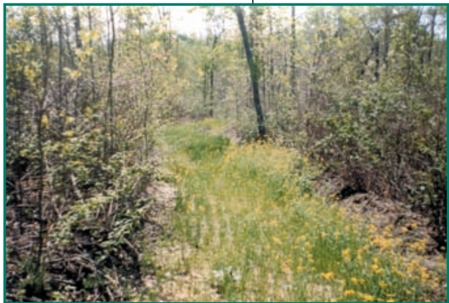
Figure 1. Logging road managed as a forest opening.