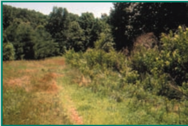
Figure 4. Good edge feathering with shrub row.

The area where a forest opening and the forest meet is called "edge" habitat (Figure 4). Ideally, these edges should be gradual transitions between openings and forest habitat. Edge habitat associated with forest openings can be enhanced by selectively removing overstory trees around openings. This practice is called edge feathering*.