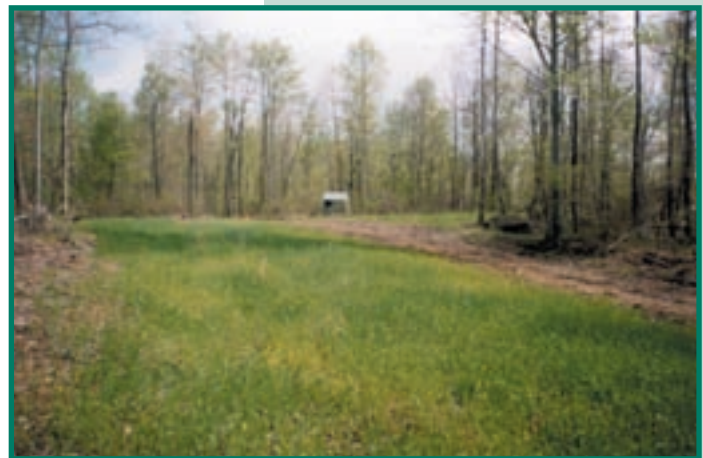
Figure 3. Wheat used as an annual grain planting on a logging road.

Forest openings can provide excellent wildlife viewing opportunities.